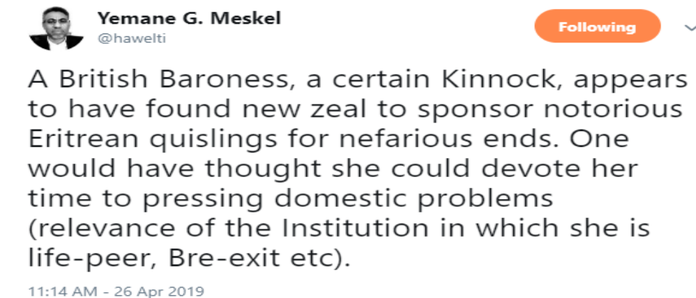
Figure 4: Tweet by Yemane Gebre Meskel, Minister of Information

democracy in Eritrea following the rapprochement with Ethiopia. 69